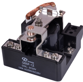
Q65F 1Z 120A