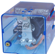
Q62FF 1Z 80A (JQX-62F)