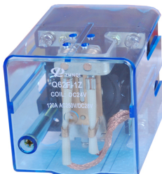
Q62FF 1Z 120A (JQX-62F)