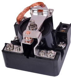
Q62F 1Z 80A (JQX-62)