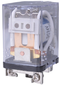
Q59F 1Z (JQX-59F)