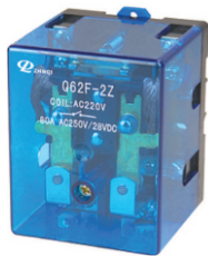
Q62F 2Z 80A (JQX-62F)