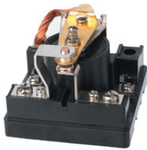
Q62F 1Z 80A (JQX-62)