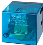
Q62FF 1Z 120A (JQX-62F)