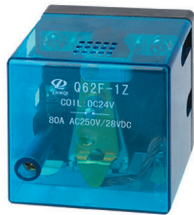
Q62FF 1Z 80A (JQX-62F)